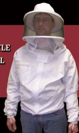
CRICKET STYLE JACKET ALL SIZES