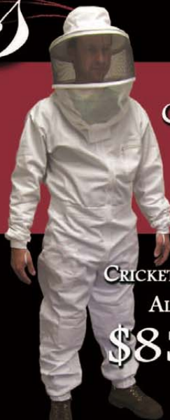
DADANT CRICKET STYLE HAT & VEIL SUIT AND JACKET