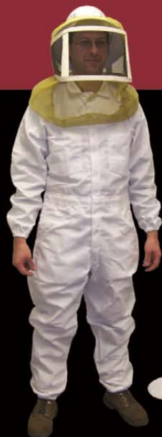
DADANT ZIPPER VEIL SUIT