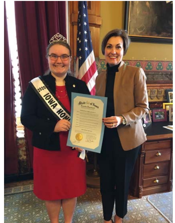
Proclamation of Honey Bee Day Gov. Reynolds with Queen Abigail