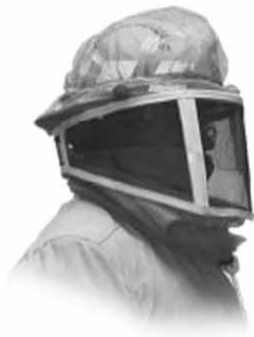
"Photo of a 'Fire Department Folding Veil' from the Dadant catalog:

Just a few supplies and the following simple procedure can prepare you for such an event, and avert a potentially deadly hazard.